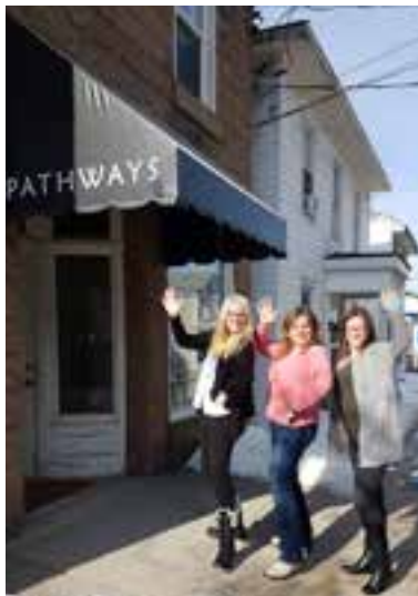
Moving Day in Sydenham